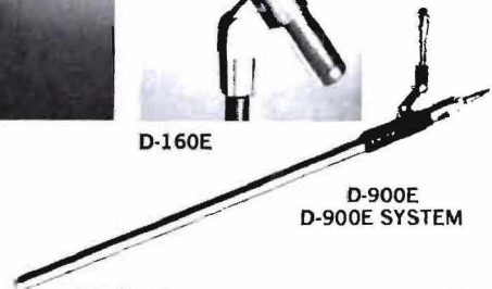
D-900E D-900E SYSTEM